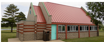
Swimming Pool Shelter ($50/day)