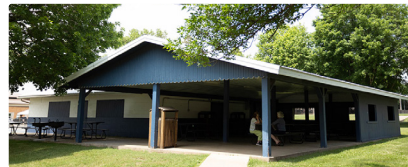
Vets Park Shelter ($50/day)