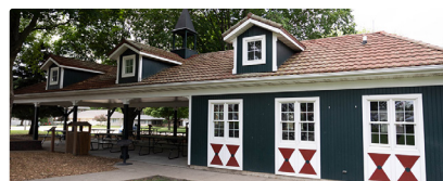
Windmill Park Shelter ($50/day)

For descriptions of the shelter houses, or to reserve a shelter house ONLINE ONLY , scan the QR code, or go to: orangecityiowa.com/shelter-houses/reserve-campsites-shelter-houses