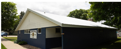
Vets Park Scout House ($50/day)

The arrival of summer means picnics, reunions, and outdoor birthday parties. After being inside all winter, we can all agree outdoors is the place to be. For a very inexpensive “get away”, Orange City has four shelters which are available to rent for your group activities. All of these City-owned facilities have a refrigerator, stove, sink, and counters.