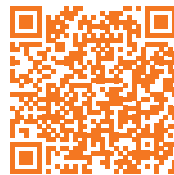
Annual Water Report PDF